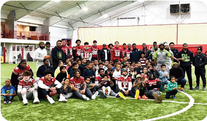
Temple athletes were happy to practice with the Inner City Warriors team.

Not here for our profit. Here for yours.